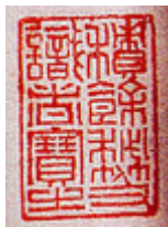
4.積餘秘籍識者寶之